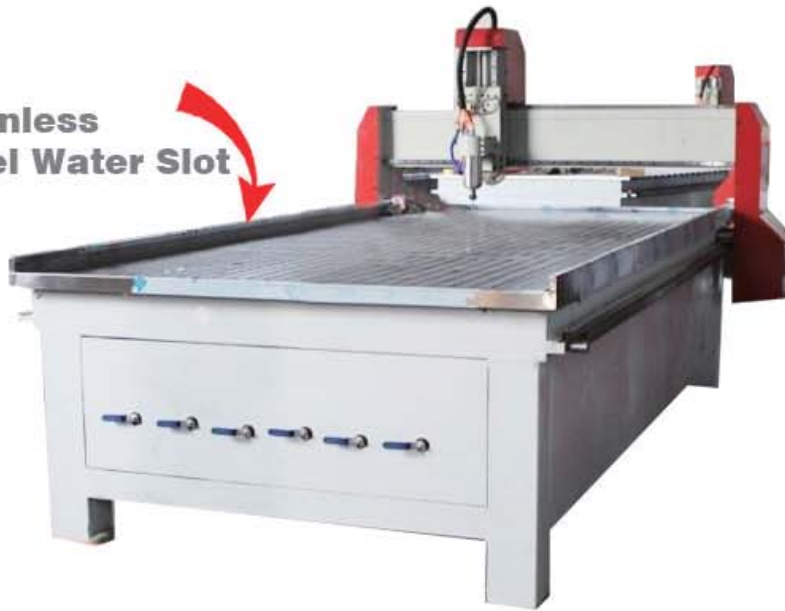
Stainless Steel Water Slot